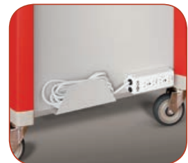
Plug Outlet Strip UL1363A Rated