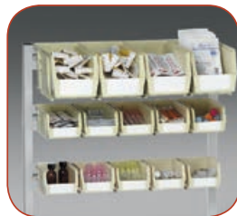
Bulk Storage Bins