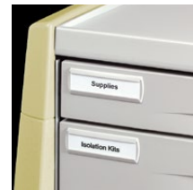
Drawer Label Holder