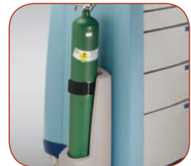
Oxygen Tank Holder