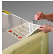
Clear Top Mat