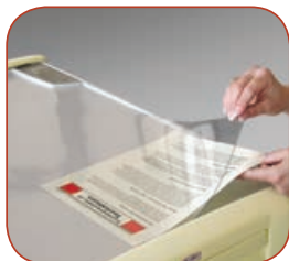
Clear Top Mat