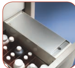
Internal Lock Box