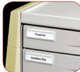
Drawer Tag Holder