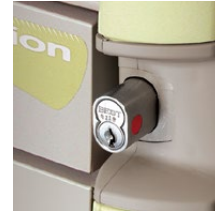
Best® Core Locks*