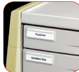
Drawer Tag Holder