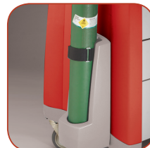
Oxygen Tank Holder