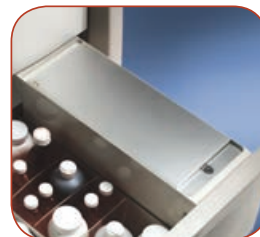
Internal Lock Box