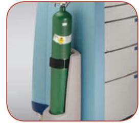
Oxygen Tank Holder