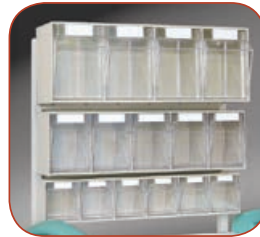
Tilt Bin Organizers