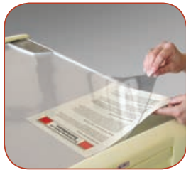
Clear Top Mat