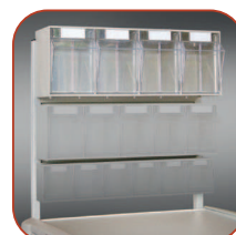
Tilt Bin Organizer