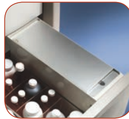
Internal Lock Box