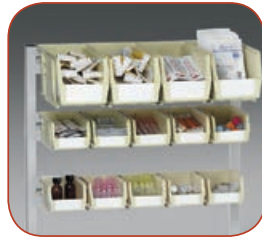
Bulk Storage Bins