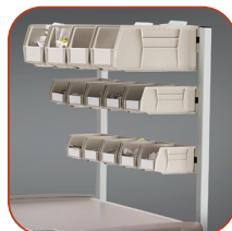
Bulk Storage Bins