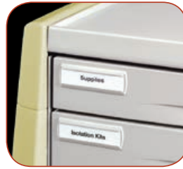
Drawer Tag Holder