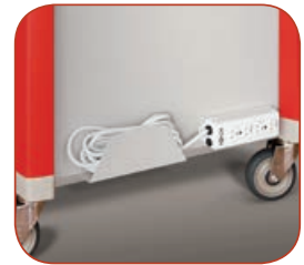
Plug Outlet Strip UL1363A Rated