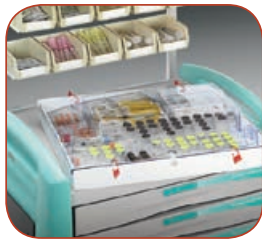
Divided Drawer Tray