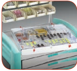
Divided Drawer Tray