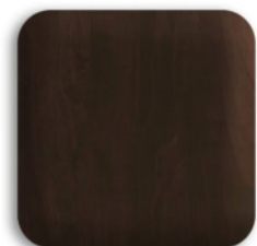
Chocolate Pear Tree