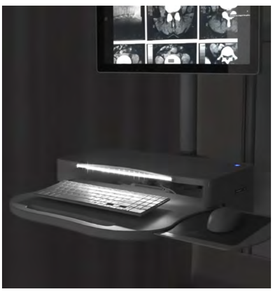
SideKick Secondary Worksurface gives caregivers room to work, an integrated light for night charting, and optional RFID security