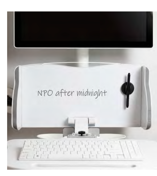
Flip up your SideKick Secondary Worksurface for quick access to storage and magnetic whiteboard