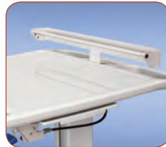
Laptop Security Bar