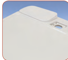
Blank Cover Plates