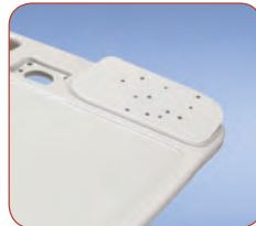
Scanner Mount Plate