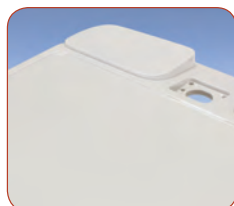
Blank Cover Plates