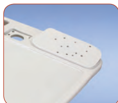
Scanner Mount Plate