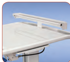
Laptop Security Bar