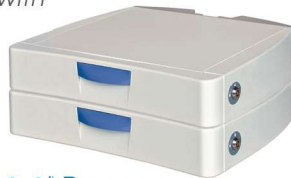
2-3" Drawers Electronic lock or non-locking