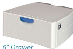
6" Drawer Electronic lock or non-locking