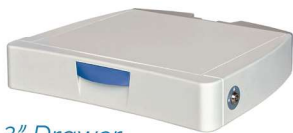
3" Drawer Electronic lock or non-locking

Flexibility to configure workstation with storage drawers in 3" or 6" depths