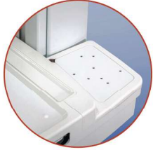
Barcode Scanner Shelves and Scanner Holder Options