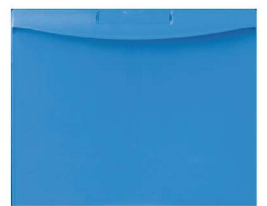
Pharmacy Robot Envelope Drawer Locking Only: 1779309