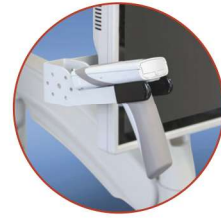
Forked Scanner Holder