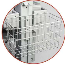
Wire Basket (standard or extra large)