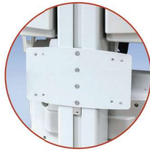
Infection Control Wipes Bracket