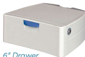
6" Drawer Electronic lock or non-locking