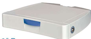
3" Drawer Electronic lock or non-locking

Flexibility to configure workstation with storage drawers in 3" or 6" depths